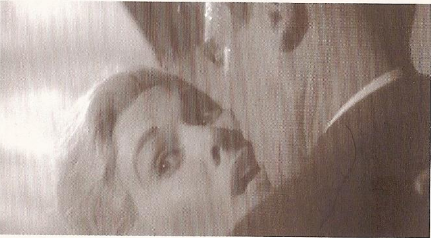
The second time – breaking off at the sight of the nun