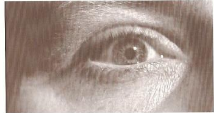
The eye at the beginning of Peeping Tom