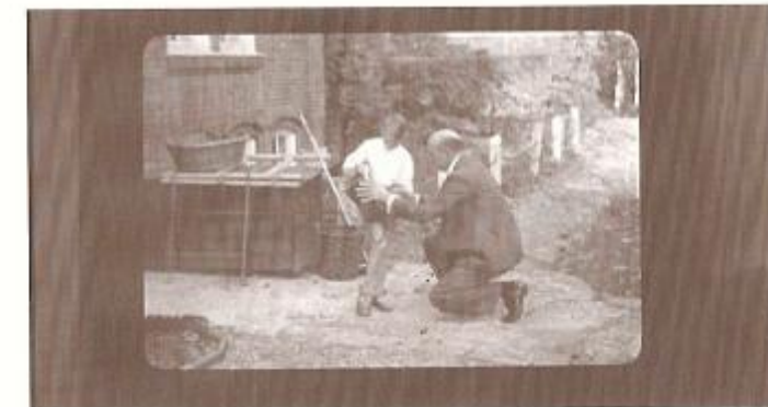
Powell's cameo appearance