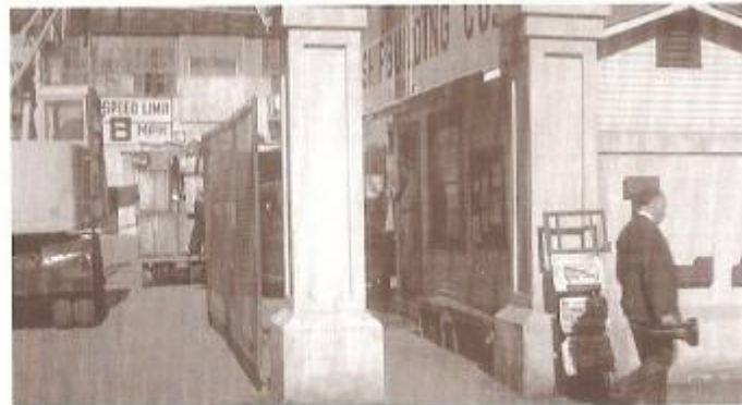
Hitchcock's cameo appearance