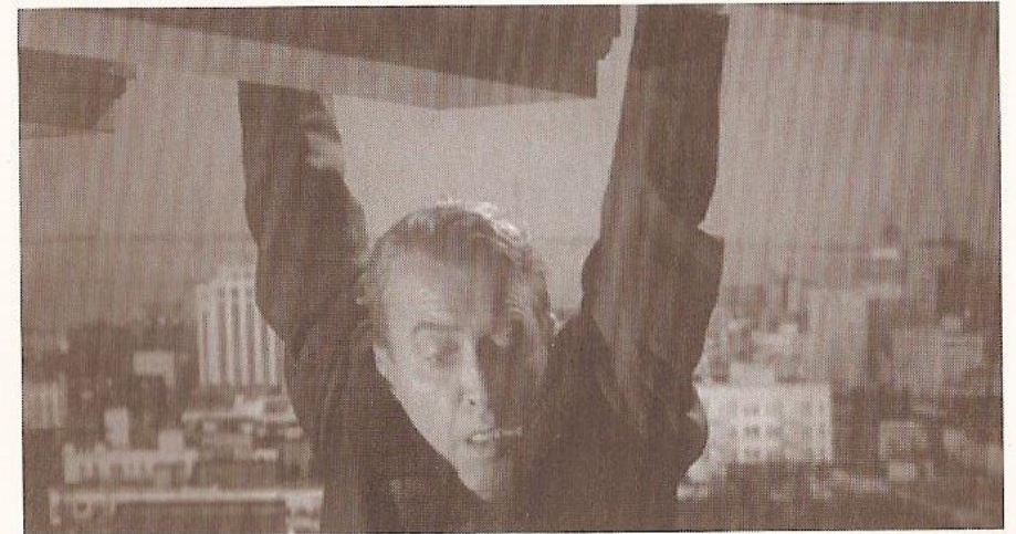
... looping back to the beginning ... ?