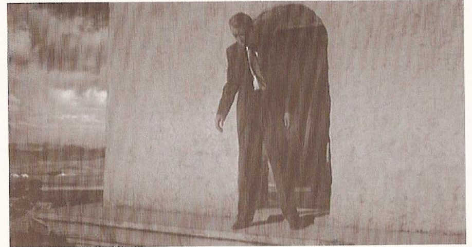
The end ...