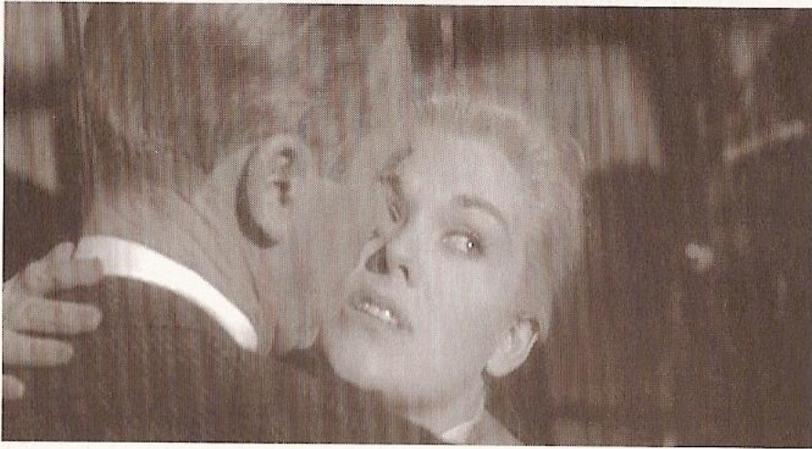
At the mission the first time – breaking off at the demands of the Elster plot